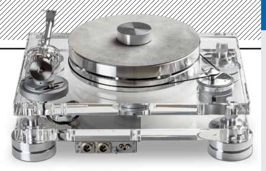
ABOVE: A DIN-terminated audio cable plugs into the base of the tonearm, serving a terminal box that offers both RCA and balanced XLR outputs (the latter for MCs only). An outboard 'wall wart' DC PSU feeds directly into the AC motor housing

at odds with the large, heavyweight turntable sitting on my rack.