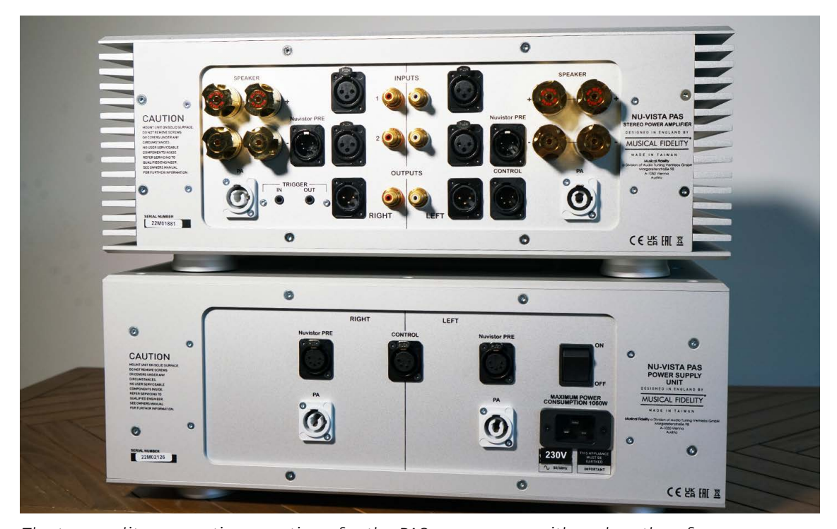
The top quality connections continue for the PAS power amp, with no less than five connecting cables for the Nu-Vista and main power amp stages

The PAS power amp gets no less than five cables all in to link it up to its PSU, plus a mains cable for the latter. There's the same trio of four and five pin XLRs to feed the PAS's Nu-Vista stage independently, plus a pair of heavy duty Neutrik PowerCon connectors, feeding the left and right main power amp stages, again underlining the no-compromise approach to separation.