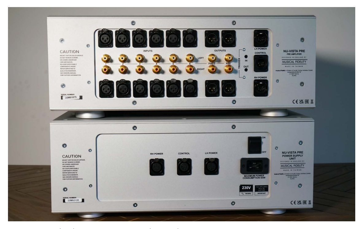
Nu-Vista PRE (top) and dedicated PSU (bottom) sporting a dozen analogue inputs spread over RCA and XLR. Outputs follow suit, with fixed and variable offerings. Note the trio of connections to the PSU for left, right and control

Hooking them up is a tad more complex than your average pre/power package, but everything is clearly labelled, with quality cables supplied. Starting with the preamp, a large mains cable feeds the PSU, with twin five-pin and a single three-pin XLR linking it to the main unit.