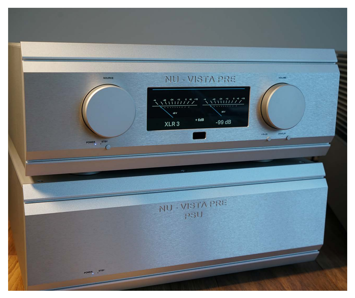
The large rotary input select and volume dials are silky smooth operators. The range is also available in black finish

But that's only half the story, because like the power amp, you also get a separate dedicated external PSU with twin toroidal transformers in an equally sized case, that's almost half a metre wide/deep and over 18cm high. So when you factor in the power amp package too, that's four large components you'll need to accommodate, weighing between 22kg to 40kg each, hence you'll need a rack (and back) up to the task. The extra box count of course isn't just for bragging rights, as housing the mains transformers away from the all important audio circuits reduces noise and stray magnetic fields, with their large separate cases also acting as Faraday cages.