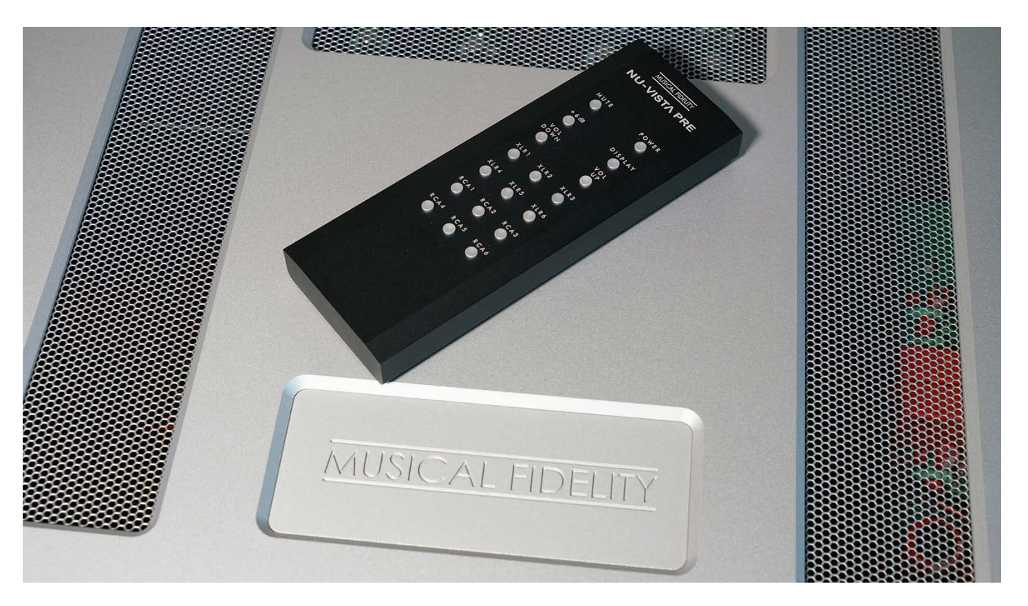
Probably the best quality remote Musical Fidelity has ever made, hewn from solid metal with a screw down battery cover

The front panel displays are better executed than most and befits products at this price, with backlight options in white or black and plain text or analogue style VU meters to choose from. These can be selected via the front panel controls or via the PRE's solid metal remote (which embarrasses the plastic supplied remotes of cheaper MF gear).