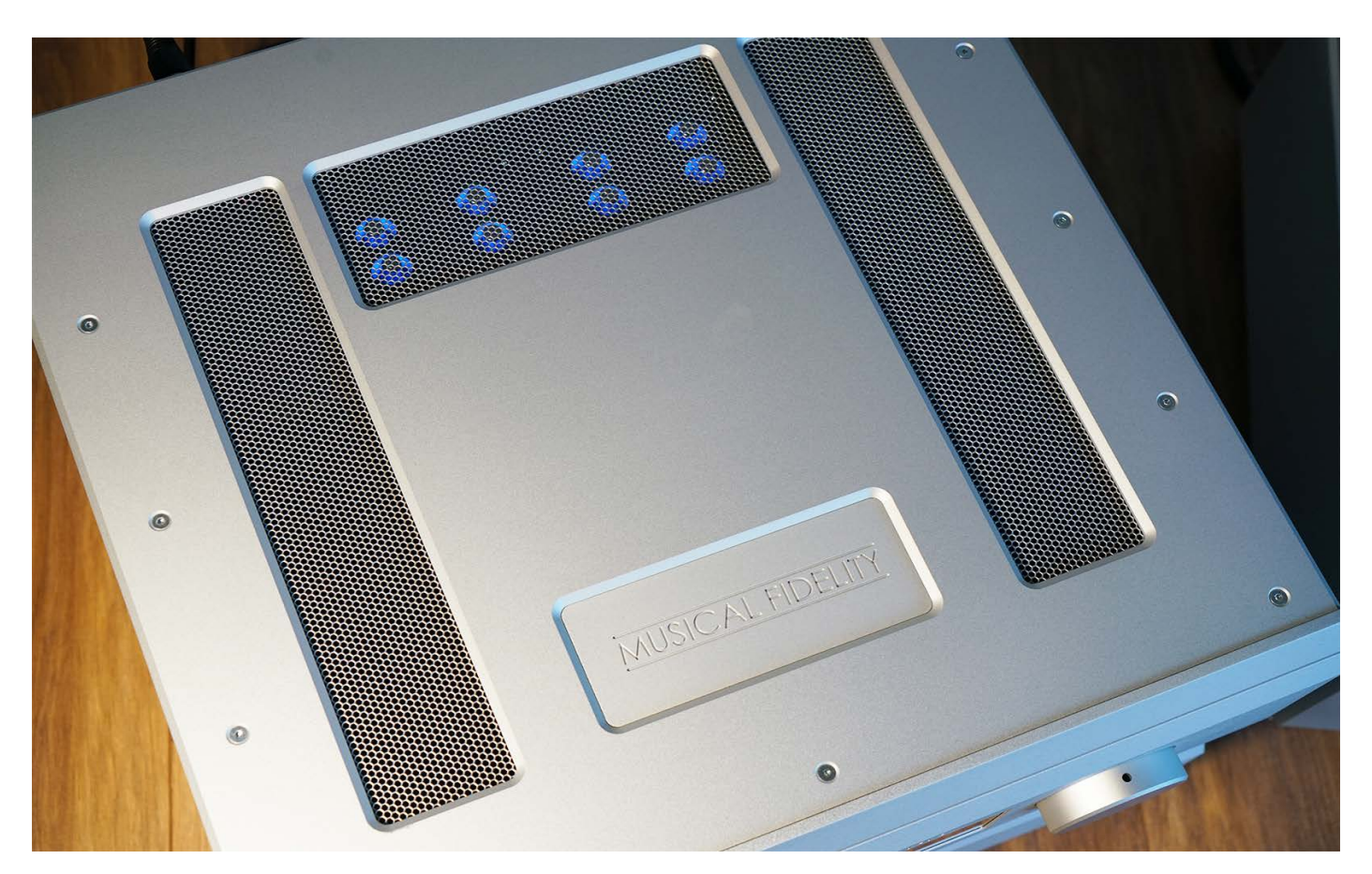
Those glowing blue lights reveal the all important nuvistor output devices from which the model range name is derived

Having rubbed shoulders with MF's finest (and largest) solid state amps for some years, the reintroduced Nu-Vista models follow in the footsteps of the original models from 2014, only they've now been elevated as the brand's flagship range under Lichtenegger. And rightly so in my opinion, as they combine all of MF's solid state amplifier knowhow with what was the latest and most advanced tube of its time (the nuvistor), which bridged the gap between traditional valves of old and transistors, when they were produced back in the late '50s.