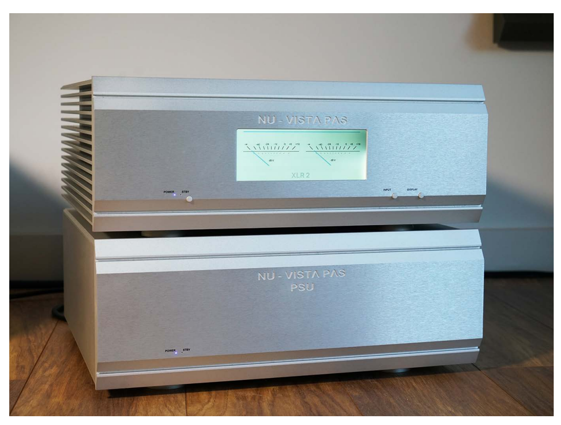
Nu-Vista PAS power amp package, showing one of four backit display options

Connections wise you're generously served if analogue is your dish of choice, with a dozen pairs of analogue inputs, split evenly over line-level (RCA) and balanced (XLR) connections. There's also fixed and variable outputs (line-level and balanced), but alas no phono stage or digital inputs, underlining the Nu-Vista pairings' thoroughbred status (and allowing for more dedicated Nu-Vista standalone products further down the line).