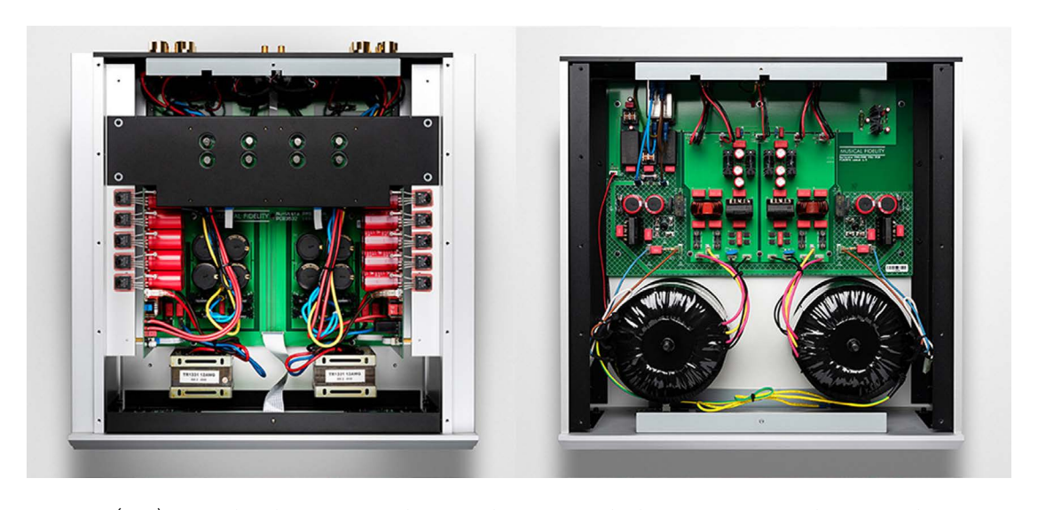
The PAS (left) revealing its bank of eight nuvistors set within the black bracing bar, with five transistors per side accounting for the generous heat sinking on the amp's side cheeks. PSU (right) plays host to a pair of generous transformers, accounting for its 40kg heft

Play the remastered 24-bit/48kHz of Jennifer Warne's grown-up cover of The Waterboys' breakthrough smash The Whole Of The Moon from her The Hunter album and the depth and texture across the percussion is astounding, seemingly removing the gaps between recording, mastering and playback by taking you directly into the performance. And when it comes to the vocals the combination of grip combined with tickle-of-a-feather like delicacy presents them in a way few other amps can match. Just hearing her vibrato as she delivers "I spoke about wings..." at around 2:20mins in without being moved isn't possible, thanks to the realism these amps bring to the music.