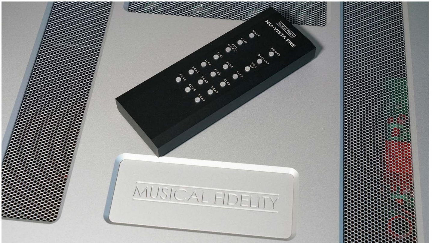
Probably the best quality remote Musical Fidelity has ever made, hewn from solid metal with a screw down battery cover

The front panel displays are better executed than most and befits products at this price, with backlight options in white or black and plain text or analogue style VU meters to choose from. These can be selected via the front panel controls or via the PRE's solid metal remote (which embarrasses the plastic supplied remotes of cheaper MF gear).