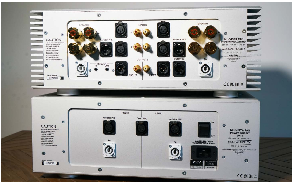
The top quality connections continue for the PAS power amp, with no less than five connecting cables for the Nu-Vista and main power amp stages

The PAS power amp gets no less than five cables all in to link it up to its PSU, plus a mains cable for the latter. There's the same trio of four and five pin XLRs to feed the PAS's Nu-Vista stage independently, plus a pair of heavy duty Neutrik PowerCon connectors, feeding the left and right main power amp stages, again underlining the no-compromise approach to separation.