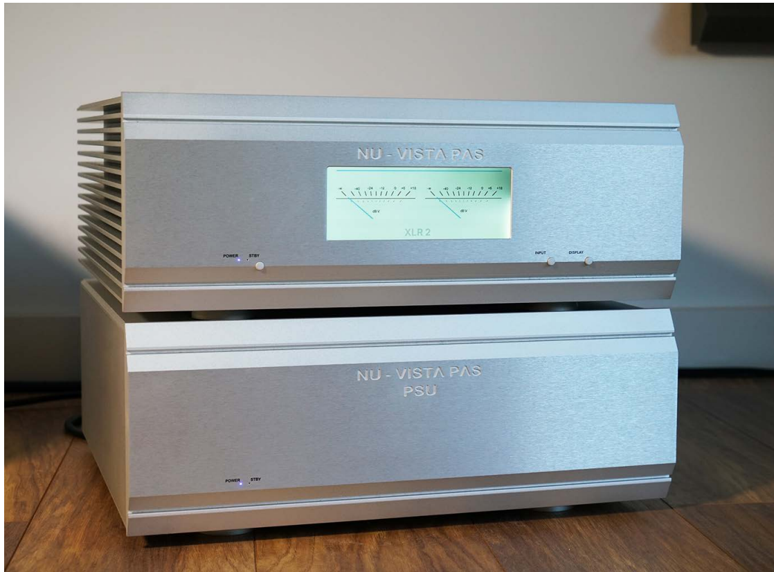
Nu-Vista PAS power amp package, showing one of four backlit display options

Connections wise you're generously served if analogue is your dish of choice, with a dozen pairs of analogue inputs, split evenly over line-level (RCA) and balanced (XLR) connections. There's also fixed and variable outputs (line-level and balanced), but alas no phono stage or digital inputs, underlining the Nu-Vista pairings' thoroughbred status (and allowing for more dedicated Nu-Vista standalone products further down the line).