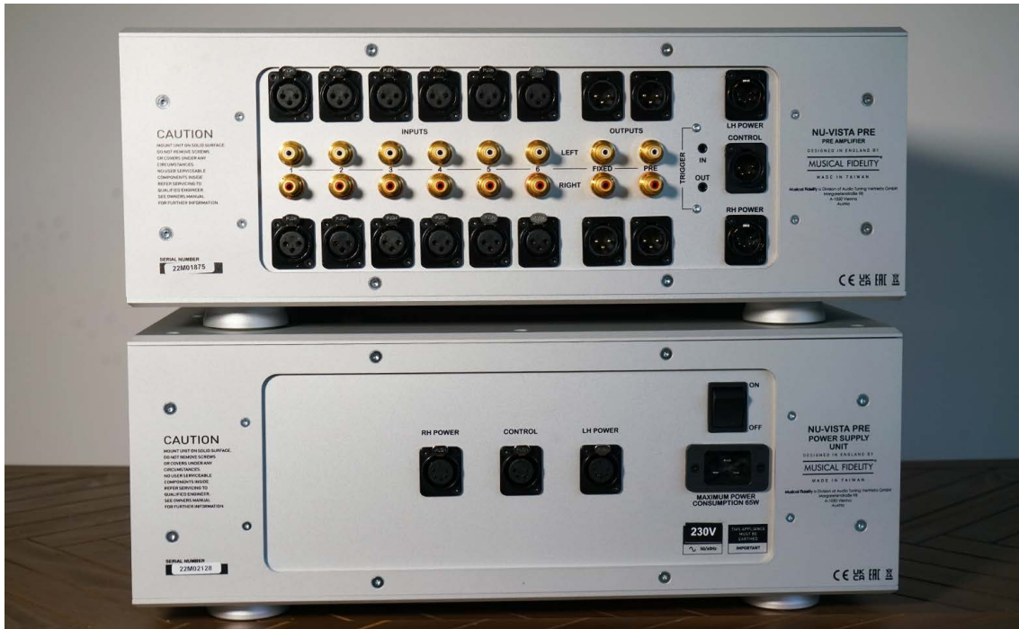
Nu-Vista PRE (top) and dedicated PSU (bottom) sporting a dozen analogue inputs spread over RCA and XLR. Outputs follow suit, with fixed and variable offerings. Note the trio of connections to the PSU for left, right and control

Hooking them up is a tad more complex than your average pre/power package, but everything is clearly labelled, with quality cables supplied. Starting with the preamp, a large mains cable feeds the PSU, with twin five-pin and a single three-pin XLR linking it to the main unit.