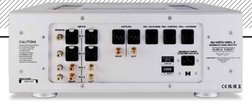
ABOVE: The Nu-Vista Vinyl 2 has two single-ended ins for MM/MCs and two balanced ins on XLRs best suited to MCs, all with their own ground terminals. RCA and balanced XLR outs lie adjacent to sockets for use with the outboard Nu-Vista PSU

me, and the impact of him using the instrument's body as percussion had me jumping in my seat. The Nu-Vista Vinyl 2 has abilities in terms of dynamics that are a rarity, even at this not inconsiderable price.