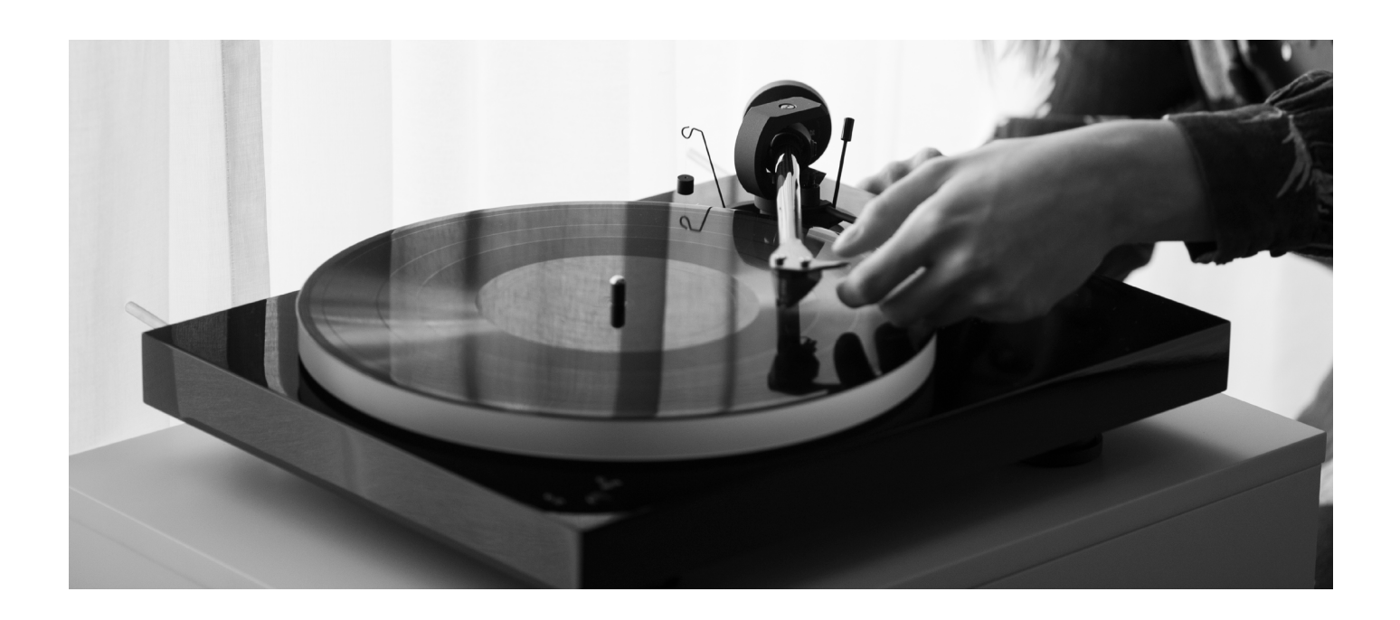
Better Motor Speed Control and Electronic Speed Change:

A sophisticated DC/AC generator board generates clean and stable power to drive the motor