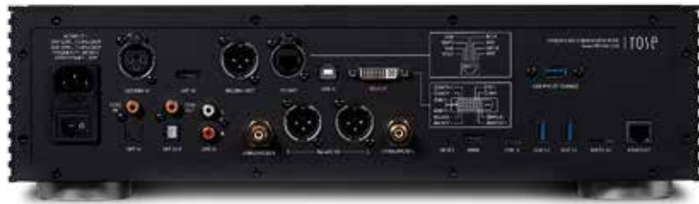
ABOVE: Line ins (RCAs) are joined by digital coax, optical and AES in/outs plus I 2 S outs on both RJ45 and DVI, and audio (ARC) and video on HDMI. There's Ethernet plus one USB-C, micro SD and two USB-A ports for external media, another for a BT/Wi-Fi dongle and USB-B for computer connection. Analogue outs are on RCAs and XLRs

That same sense of a powerful sound, if not one as absolutely resolved as could be possible, underpins the presentation of the LSO/Pappano recordings of Vaughan Williams's 4th and 6th symphonies [LSO Live LSO0867; DSD256]. Here there's no denying the scale and detail of the overall effect, even if a little of the 'liveness' is lost in the slight bloom to the way the RS150 delivers the music.