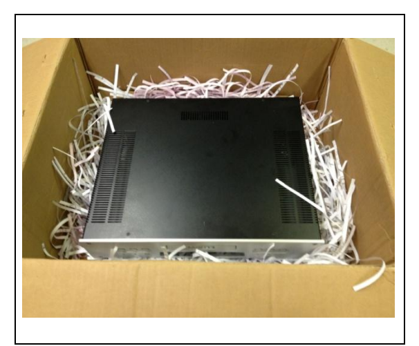
This product is not packed tightly enough and it is at risk of damage.