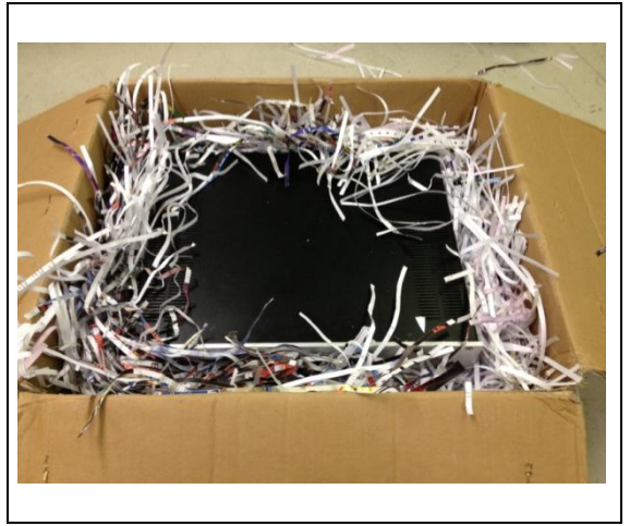
There is no padding on top of the product to prevent damage during transportation.