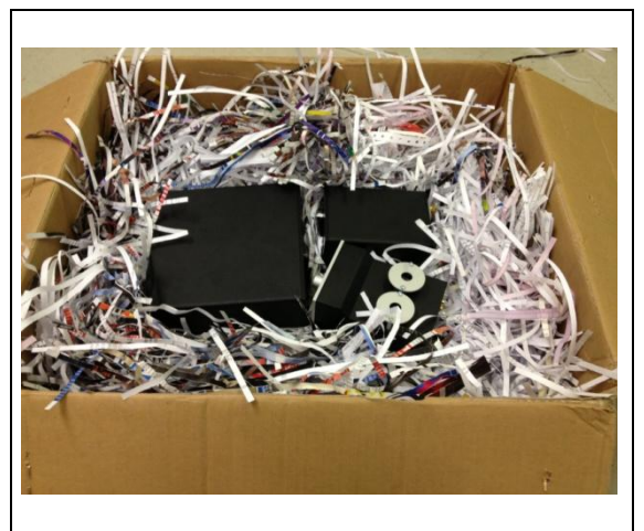
Different components are touching each other. This might cause scratches and further damage.