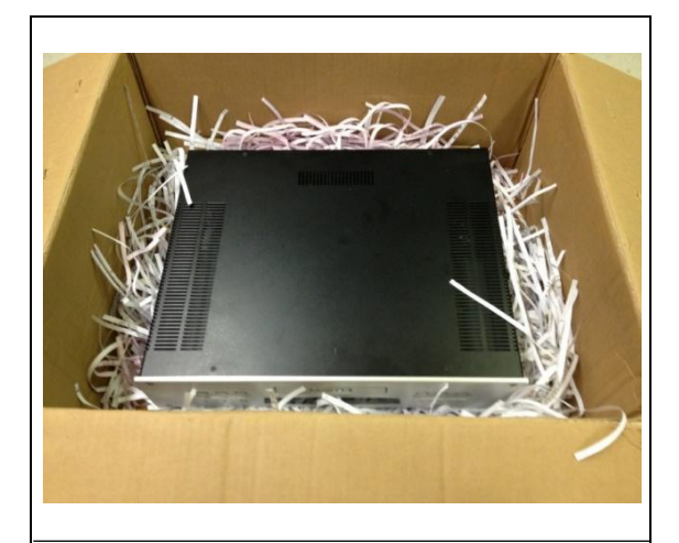
This product is not packed tightly enough and it is at risk of damage.