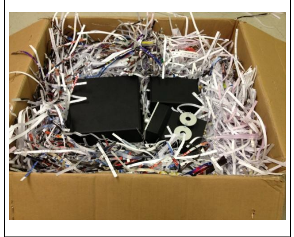
Different components are touching each other. This might cause scratches and further damage.