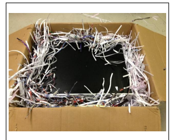
There is no padding on top of the product to prevent damage during transportation.