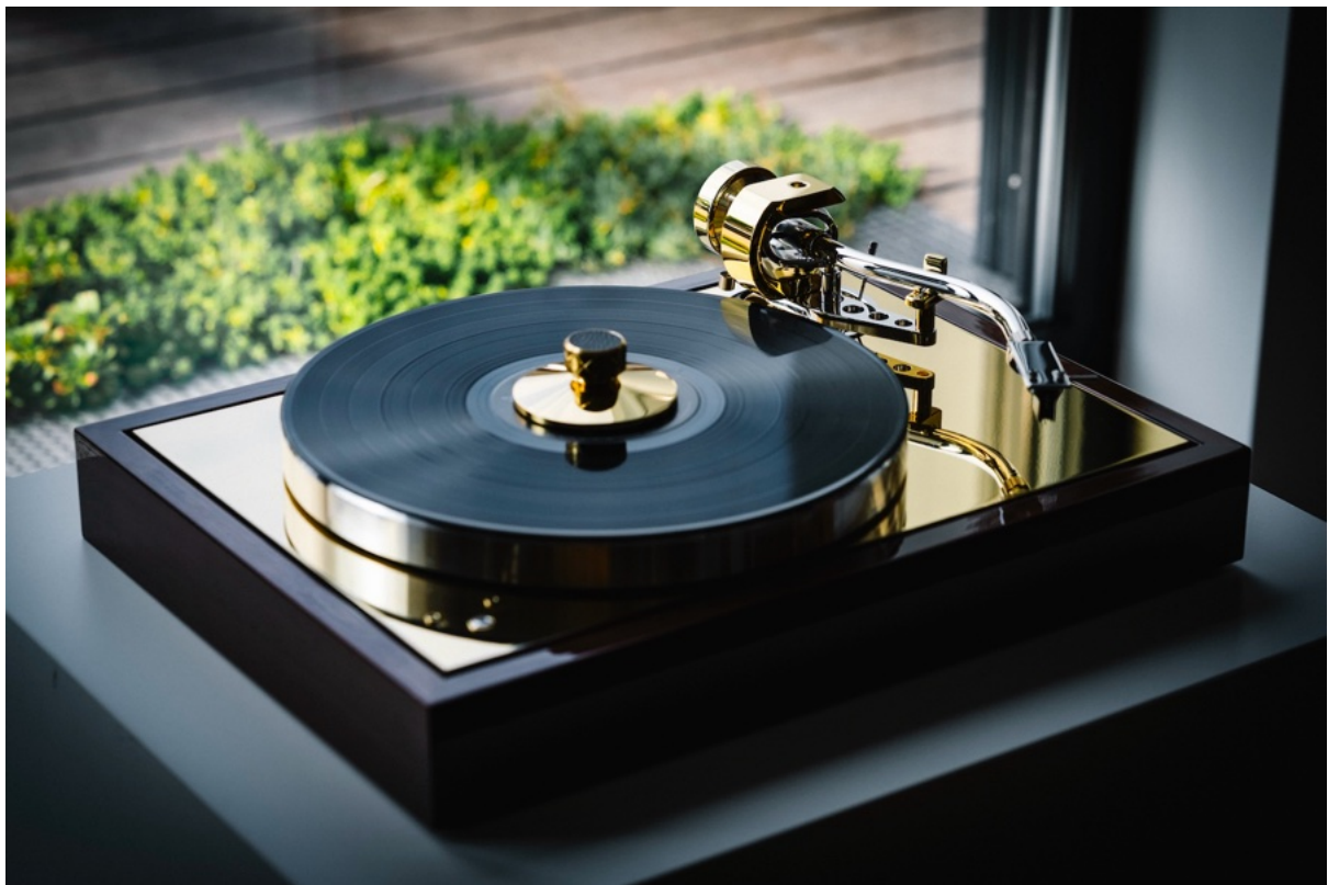
Above: Pro-Ject The Classic Reference