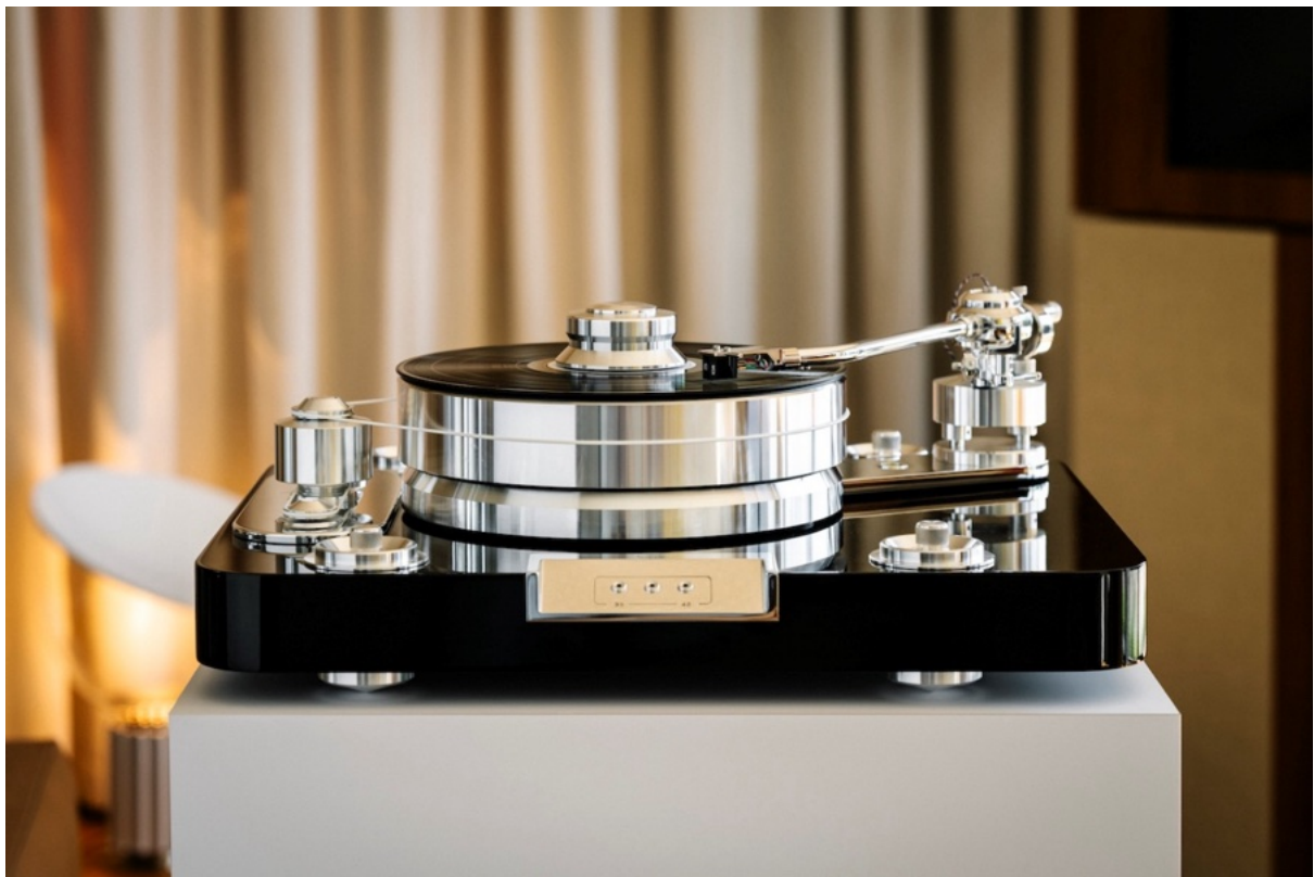
Above: Pro-Ject Signature 12.2

The Signature 12.2 and The Classic Reference turntables showcase decades of experience, craftsmanship, and audiophile-level sound.