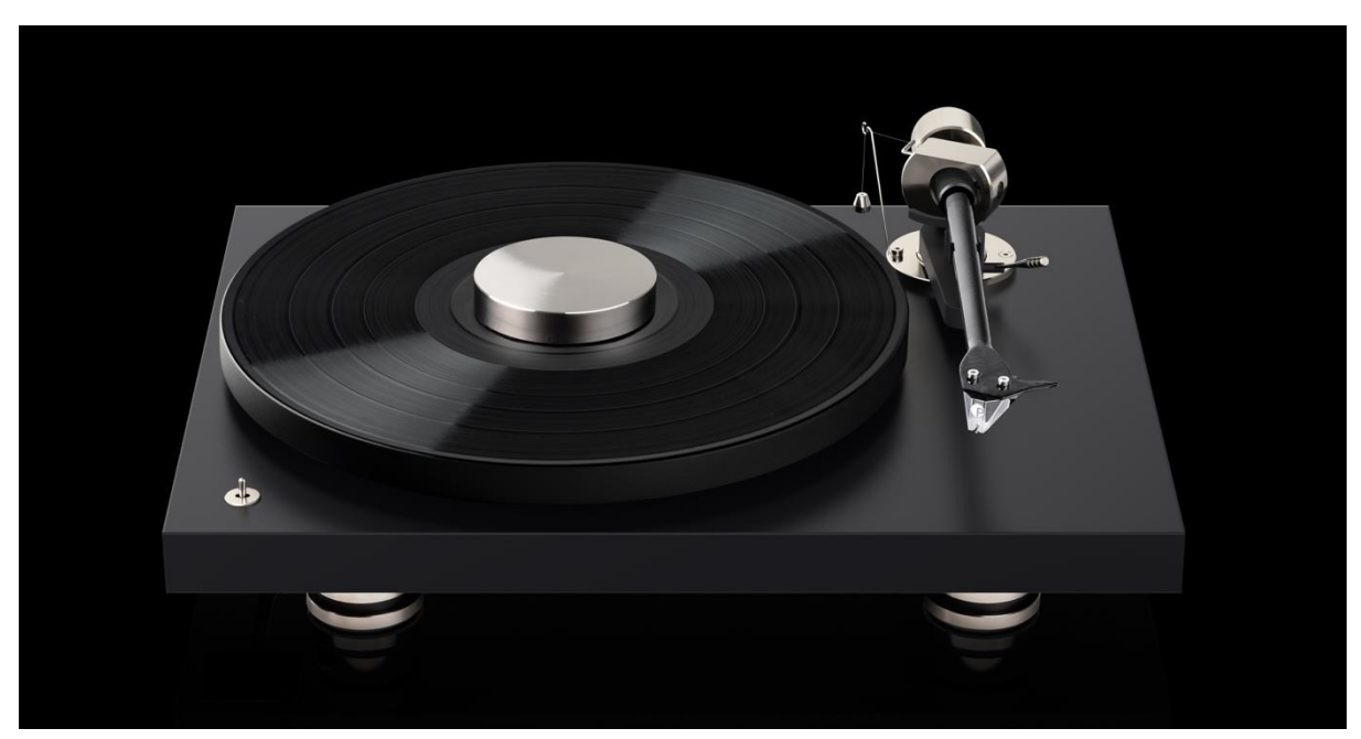
*Record Puck PRO shown, available separately, coming soon

Since 1991, Pro-Ject have been offering high-quality audio products at a reasonable price for discerning music lovers. The Debut, which came into existence during 1998, was the perfect example of this objective, but after 23 years and various iterations, Debut PRO enters the range at a new price point to set a new standard of affordable audiophilia.