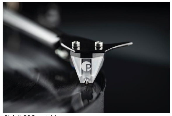
Pick-it PRO cartridge

For the Pick-IT PRO, Pro-Ject worked closely with Ortofon – the world-renowned manufacturers of premium pick-up cartridges – to develop something new. Thanks to their excellent manufacturing skills, Ortofon were able to produce a very special cartridge, designed to deliver a more lively and robust sound with a big dynamic range. The Pick-IT PRO is based on the classic Ortofon 2M body, but its sound is inspired by traditional SPU designs with its lower compliance, lower capacitance and slightly higher output. When installed on the Debut PRO, the result is a high-performance sound with true character.