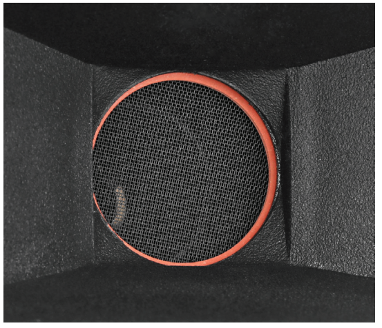
Unusual is use of a mid-range horn, running from 800Hz up to 5kHz. This pushes vocals out, from a newly designed polyamide diaphragm compression driver, Klipsch say.

in any case? Put simply, they project acoustic power forward, straight at listeners. This makes them very loud from little input. By moving air efficiently and sending it straight at you they have poke-in-the-face delivery. It's sonically different to the norm and in audio folk-lore more exciting. In practice horns don't measure so well and have strong sonic character, less boring than the norm, but also less accurate, It's like adding salt and pepper to a mild fish dish, to liven things up.