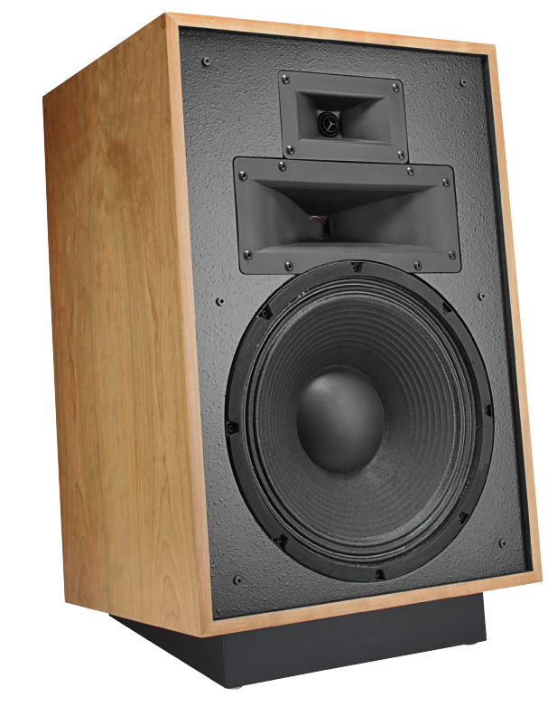
The front baffle has a black spray painted finish and the drive units lack trim rings, exposing the fixing screws. Looks better with the grille in place.

With bass heavy tracks the big bass units showed their