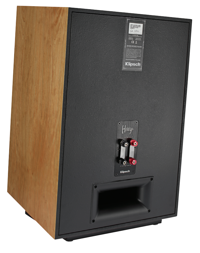
The big rear panel carries bi-wire terminals and a large horn-profile port that worked very well, our measurements showed. All the same, strong output from the horns masked its contribution.