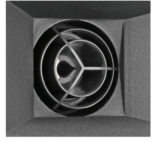
The treble horn has concentric diffusers in front of its titanium dome pressure driver. Such assemblies are very efficient.

Even with the mild mannered Creek amplifier the Heresy's remained forward in the midrange, throwing vocals at me. Sinead O'Connor was loud and clear singing Foggy Dew (CD), but the Chieftain's